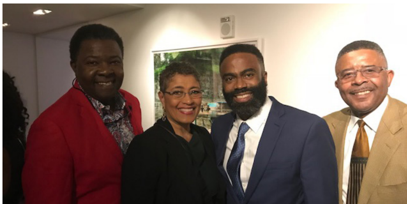
Representatives from the Wilmington SCA Chapter.

We plan on expanding the chapter launches in 2020.