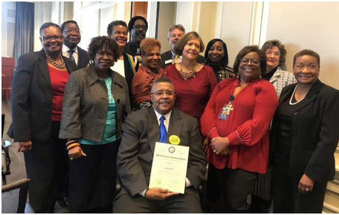
The CSI team along with some of our community partners and county officials

"We would be severely handicapped at our CSI office without the help of our team. They free me up to do things like raise money and sit at tables at which I could not ordinarily sit. They are a very talented group, and most importantly, they are dedicated to our mission. Thank you all for all that you do!"