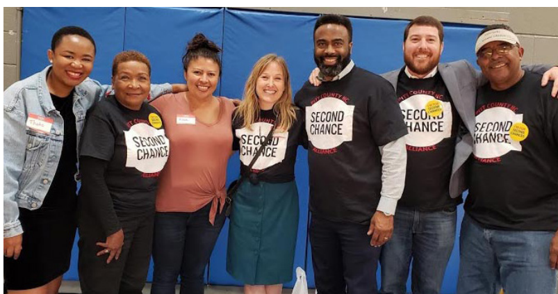
Representatives from the Pitt County SCA Chapter.

HELPING MEN AND WOMEN WHO FIND THEMSELVES ENTANGLED IN THE CRIMINAL JUSTICE SYSTEM