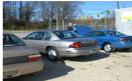
A small selection of cars that have been donated to Wheels4Hope

To donate your car , call toll free 888-946-4944 or go to www.wheels4hope.org